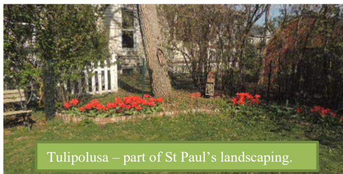
Tulipolusa – part of St Paul's landscaping.