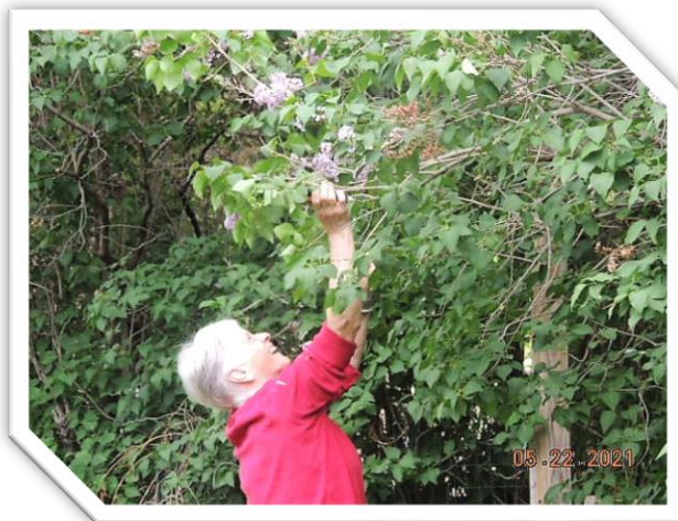
Altar guild used lilacs for the Altar on Pentecost.