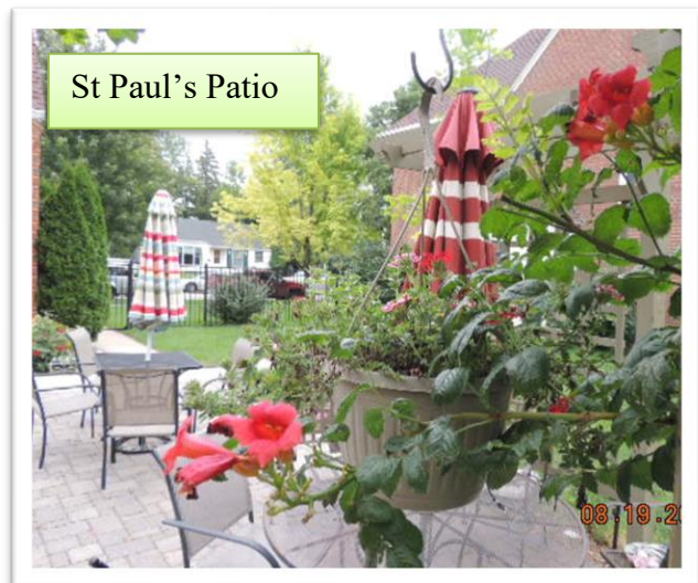
St Paul's Patio

experience. Many churches are experimenting with a dinner-service format.